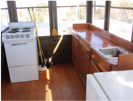
View of kitchen area electric stove, dry sink and refrigerator